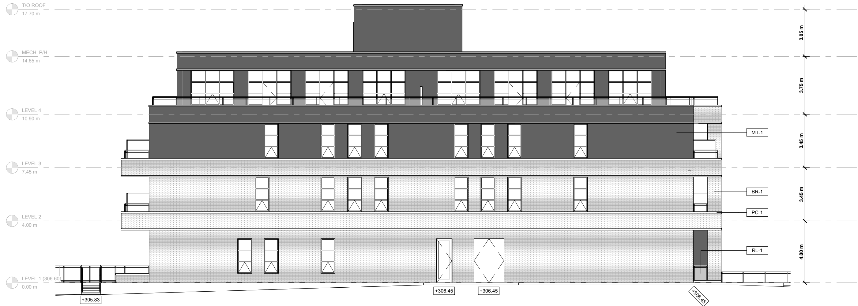
1 SOUTH (SIDE) ELEVATION 1 : 150