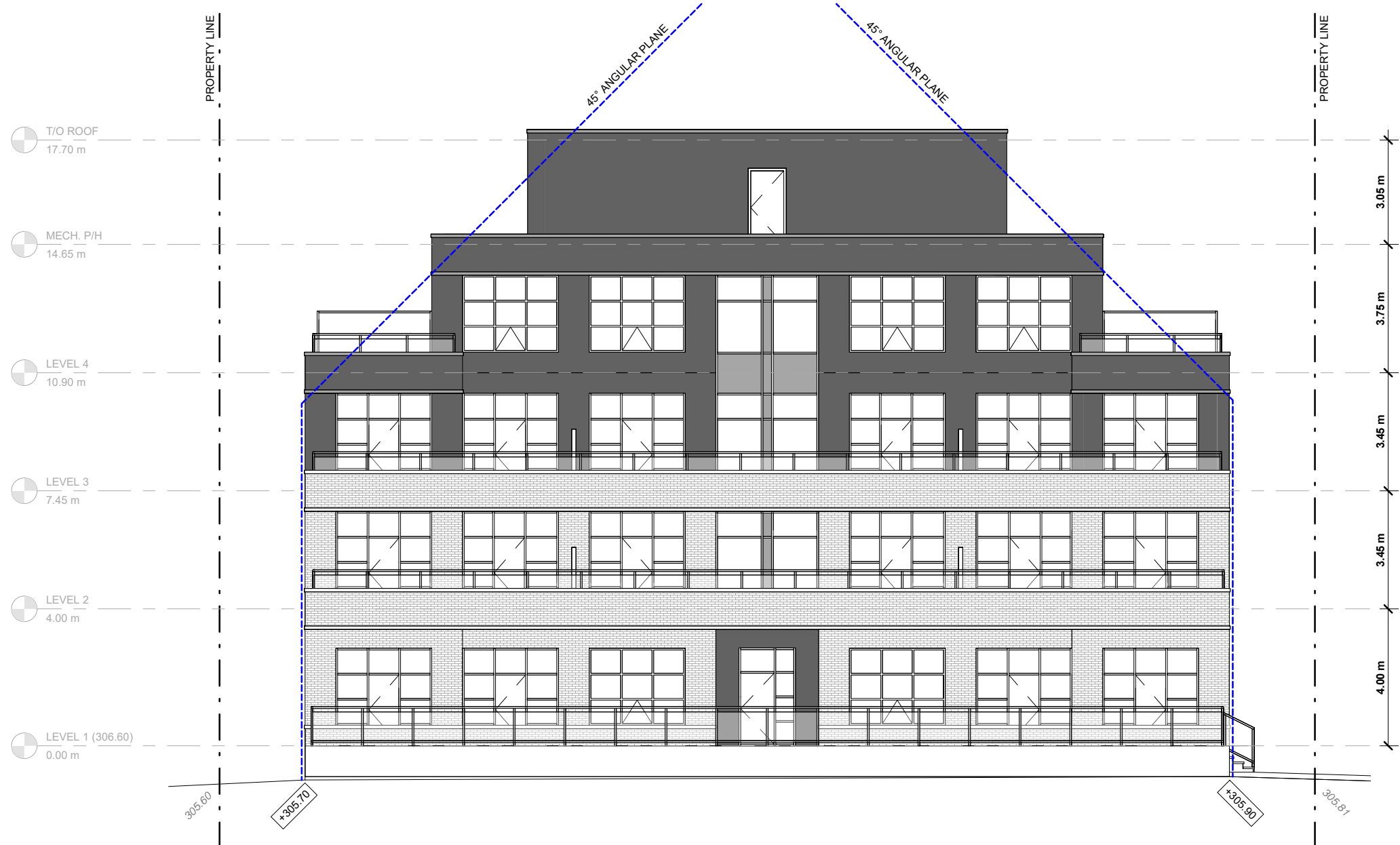
1 WEST (REAR) ELEVATION 1 : 150