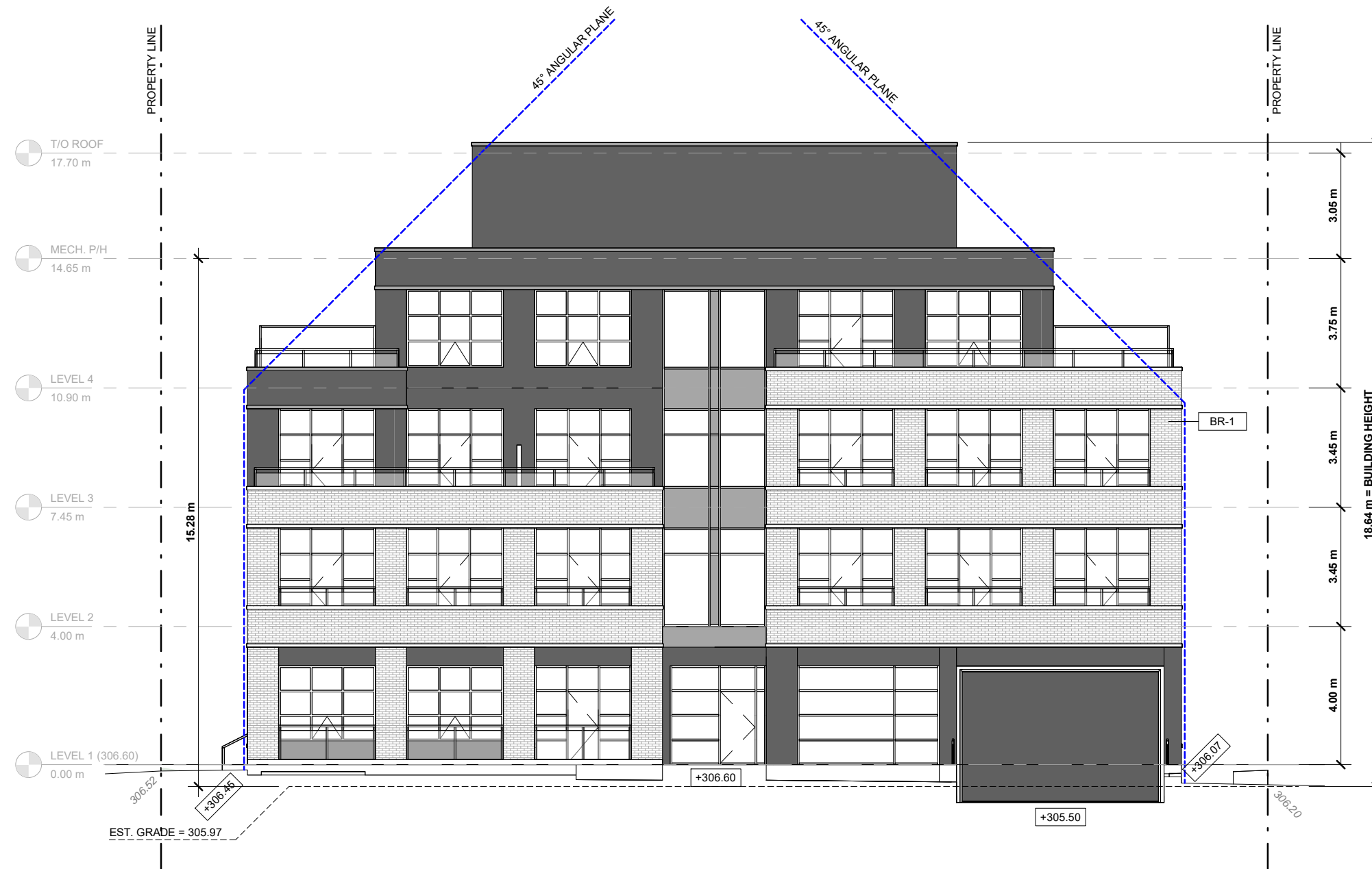
① EAST (FRONT) ELEVATION 1 : 150

CARICARI LEE ARCHITECTS 113 Miranda Avenue Toronto, ON M6B 3W8 t/ 416 962 9670 f/ 416 962 9671 e/ info@caricarilee.com www.caricarilee.com