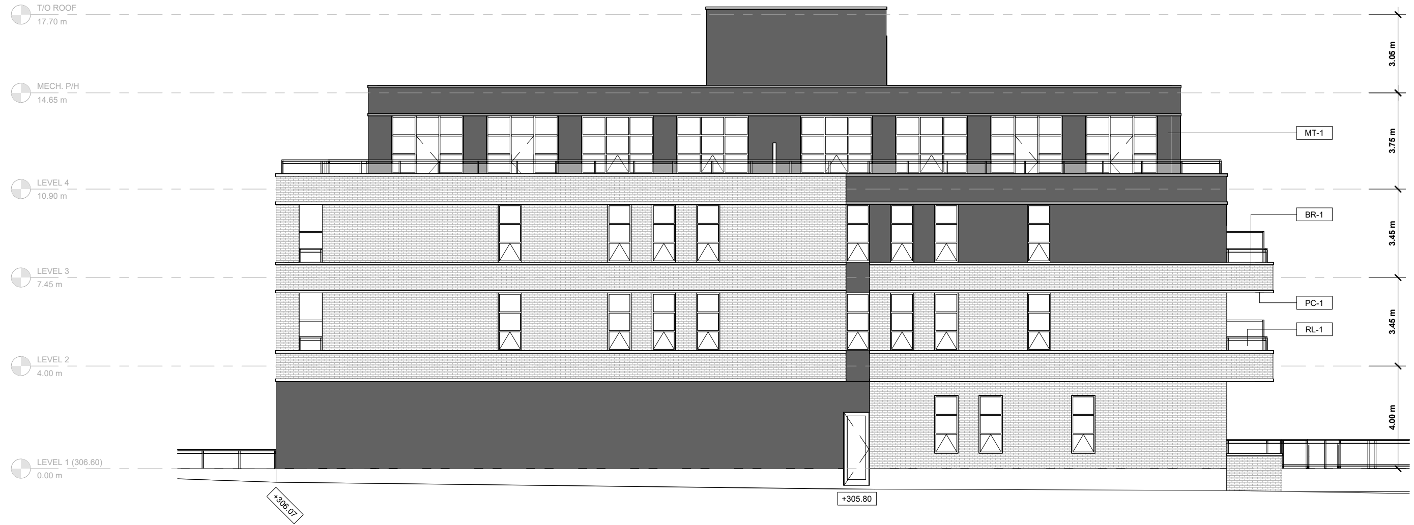
1 NORTH (SIDE) ELEVATION 1 : 150

CARICARI LEE ARCHITECTS 113 Miranda Avenue Toronto, ON M6B 3W8 t/ 416 962 9670 f/ 416 962 9671 e/ info@caricarilee.com www.caricarilee.com