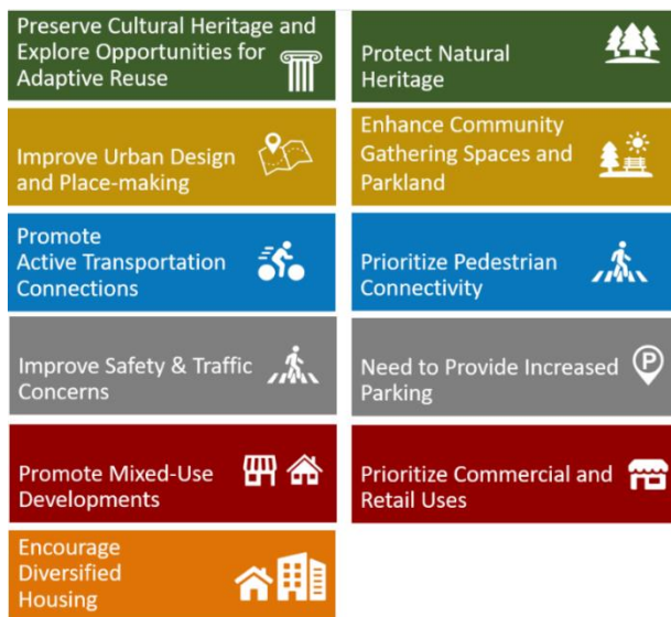
Figure 2: Key Themes for Old King Road