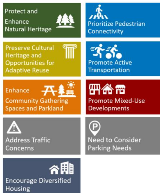
Figure 3: Key Themes for Doctors Lane

After the Key Themes are identified, the Storymap offers a detailed walkthrough outlining different aspects of the Plan that address applicable Theme(s) and objectives, similar to the example in Figure 4 below.