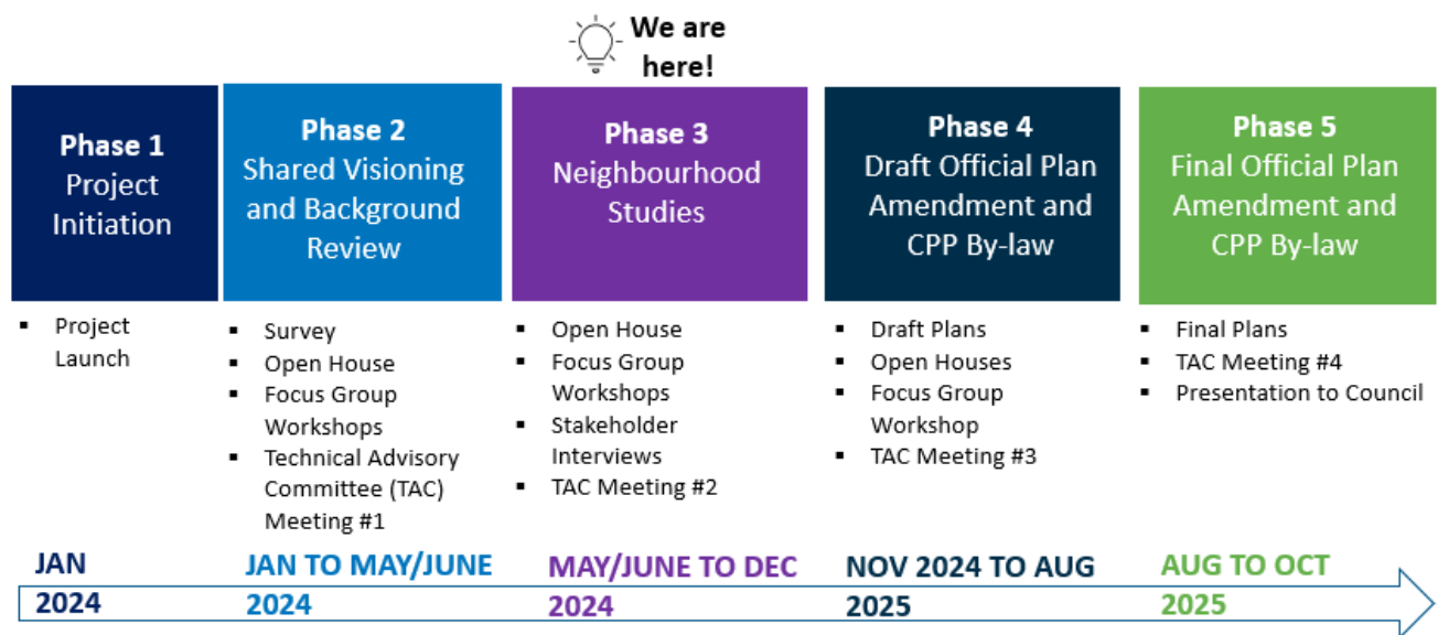
Figure 1: Project Schedule

The Doctors Lane and Old King Road Neighbourhood Plans Study, and the development of the implementing CPPS, is structured as five (5) phases. Phase 1 concluded in Q1 2024 with the public launch of the SpeakKING project page and introductory video . Phase 2 finished in May 2024 with the presentation to Council of the draft Directions Report and draft Study Areas. The work plan for the Project is generally organized as outlined in Figure 1 (below).