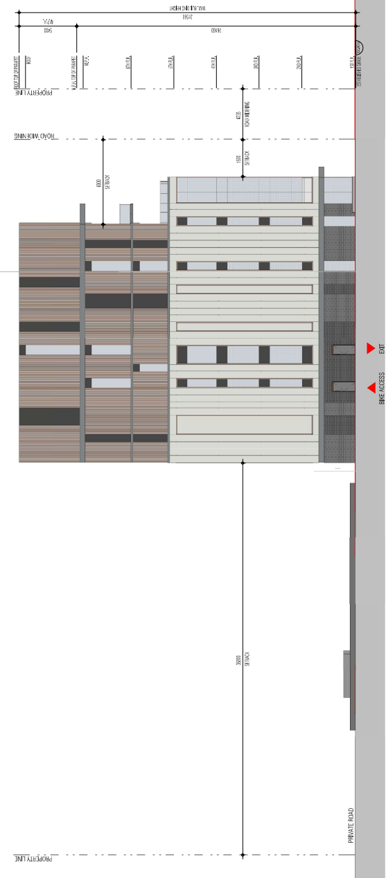
WEST ELEVATION SCALE: 1:100