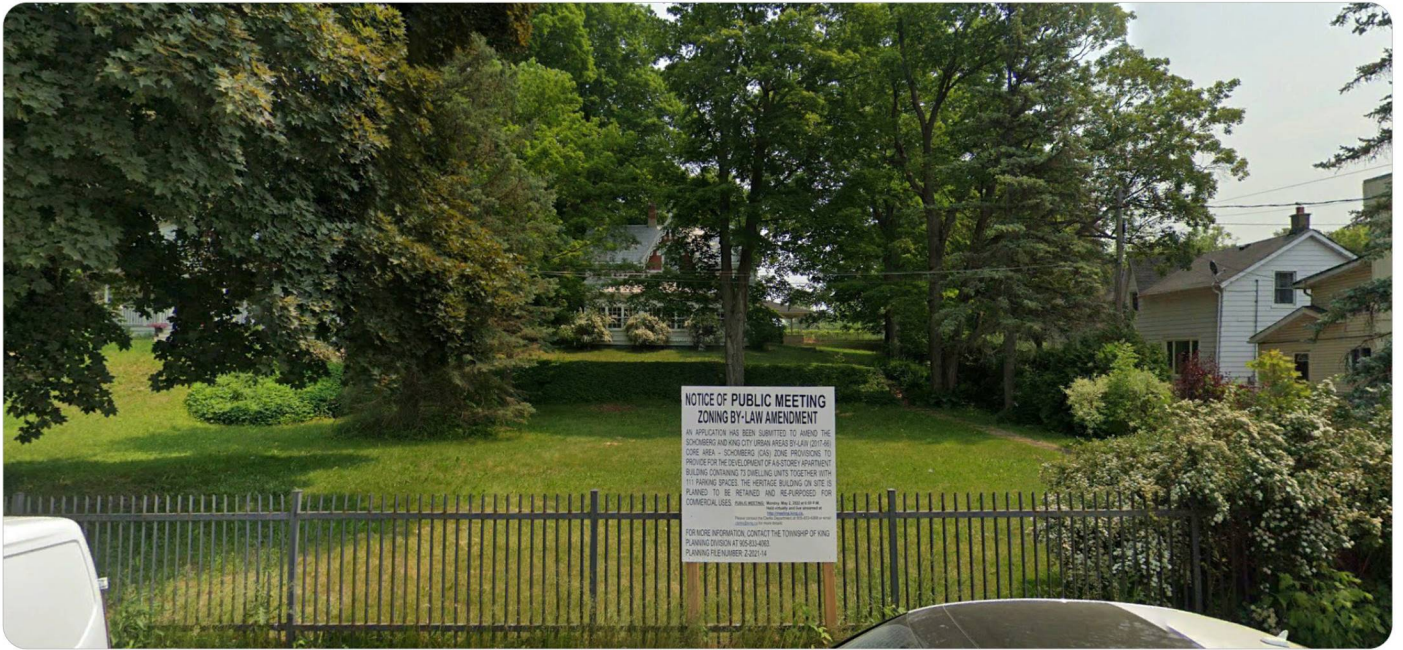
Figure 7: Viewshed 2.1 - Existing