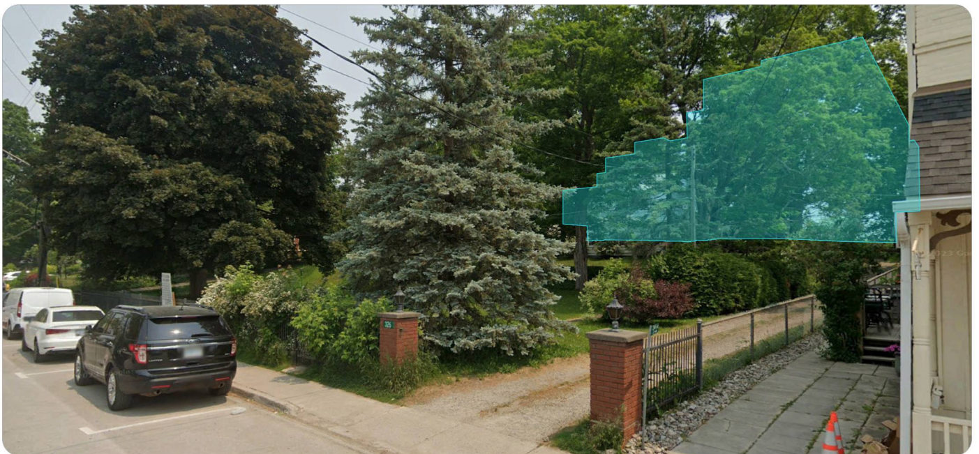
Figure 10: Viewshed 2.2 - Proposed