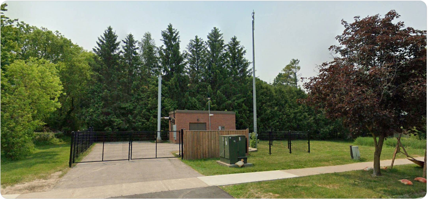
Figure 13: Viewshed 4 - Existing