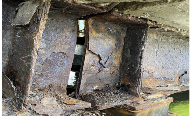
Deteriorated bridge structure

York Region has begun urgent repairs to the Holland River Bridge, at the boundary of the Township of King and Bradford West Gwillimbury. The bridge is jointly owned by York Region and Simcoe County.