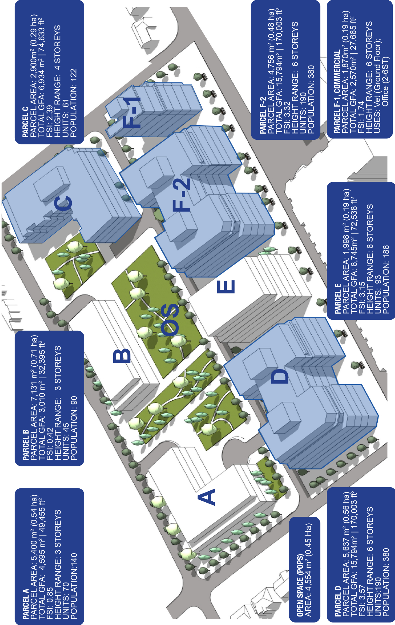
Figure 19: King Square Block Plan Stats