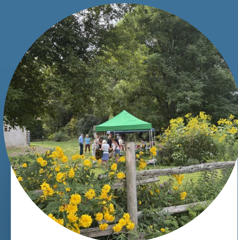
Schomberg Community Farm