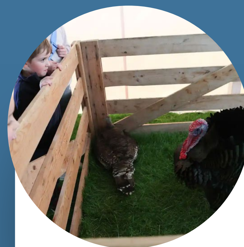
Schomberg Agricultural Society