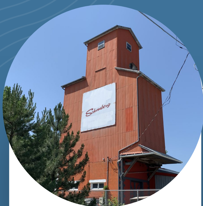
King Township Food Bank