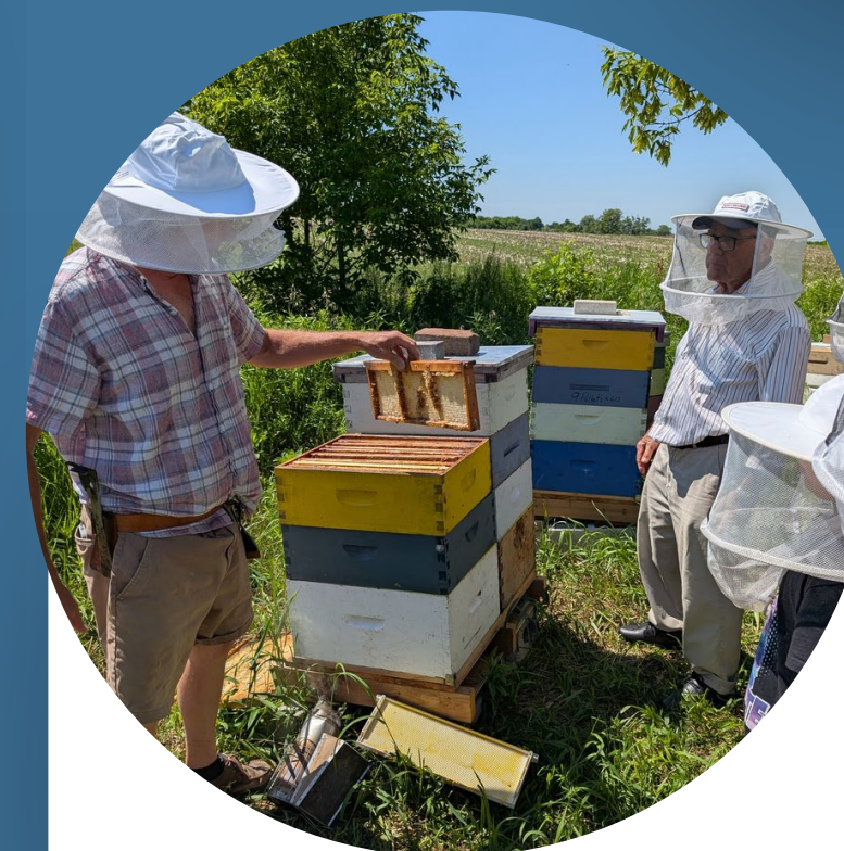
Kinsland Community Garden